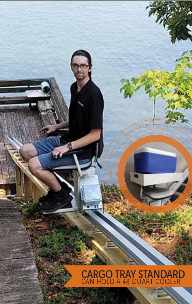
CARGO TRAY STANDARD CAN HOLD A 48 QUART COOLER